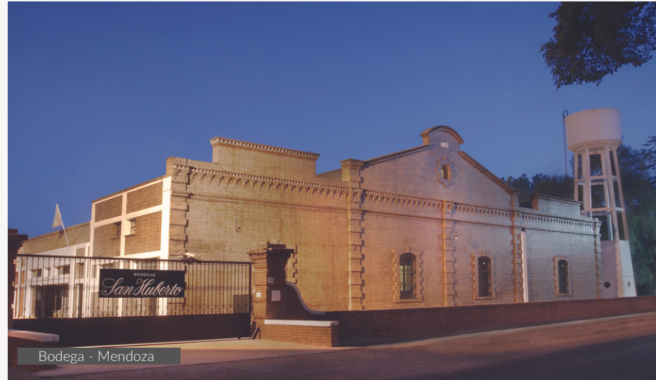
Bodega - Mendoza

The dry climate together with cold winters, warm springs and cool summers, as well as the limy and clayey soils, make the ideal conditions to obtain worldwide famous wines with unique characteristics.