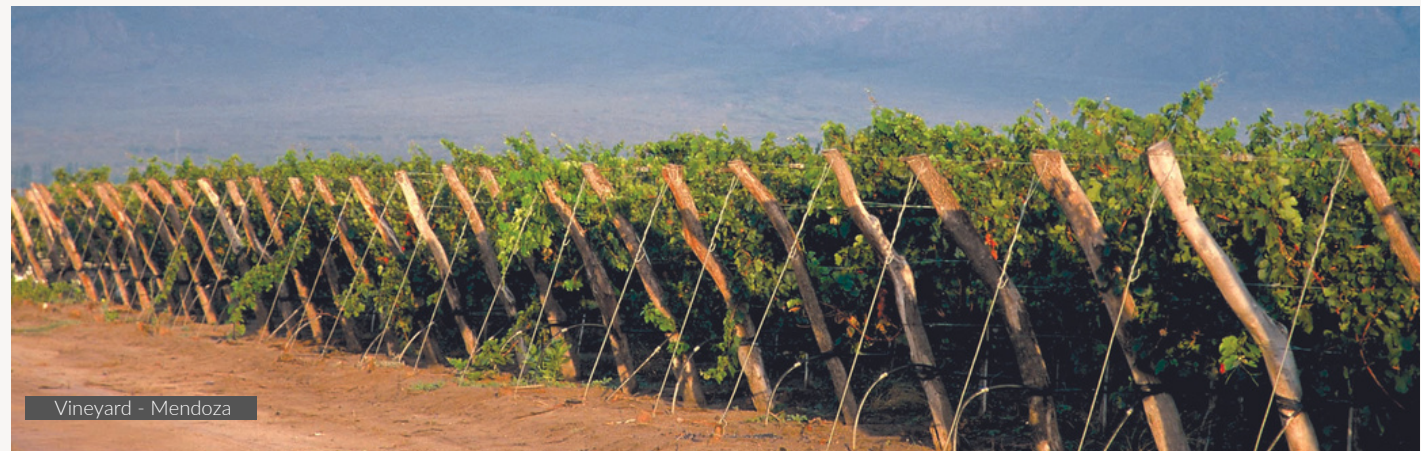
Vineyard - Mendoza

The dry climate together with cold winters, warm springs and cool summers, as well as the limy and clayey soils, make the ideal conditions to obtain worldwide famous wines with unique characteristics.